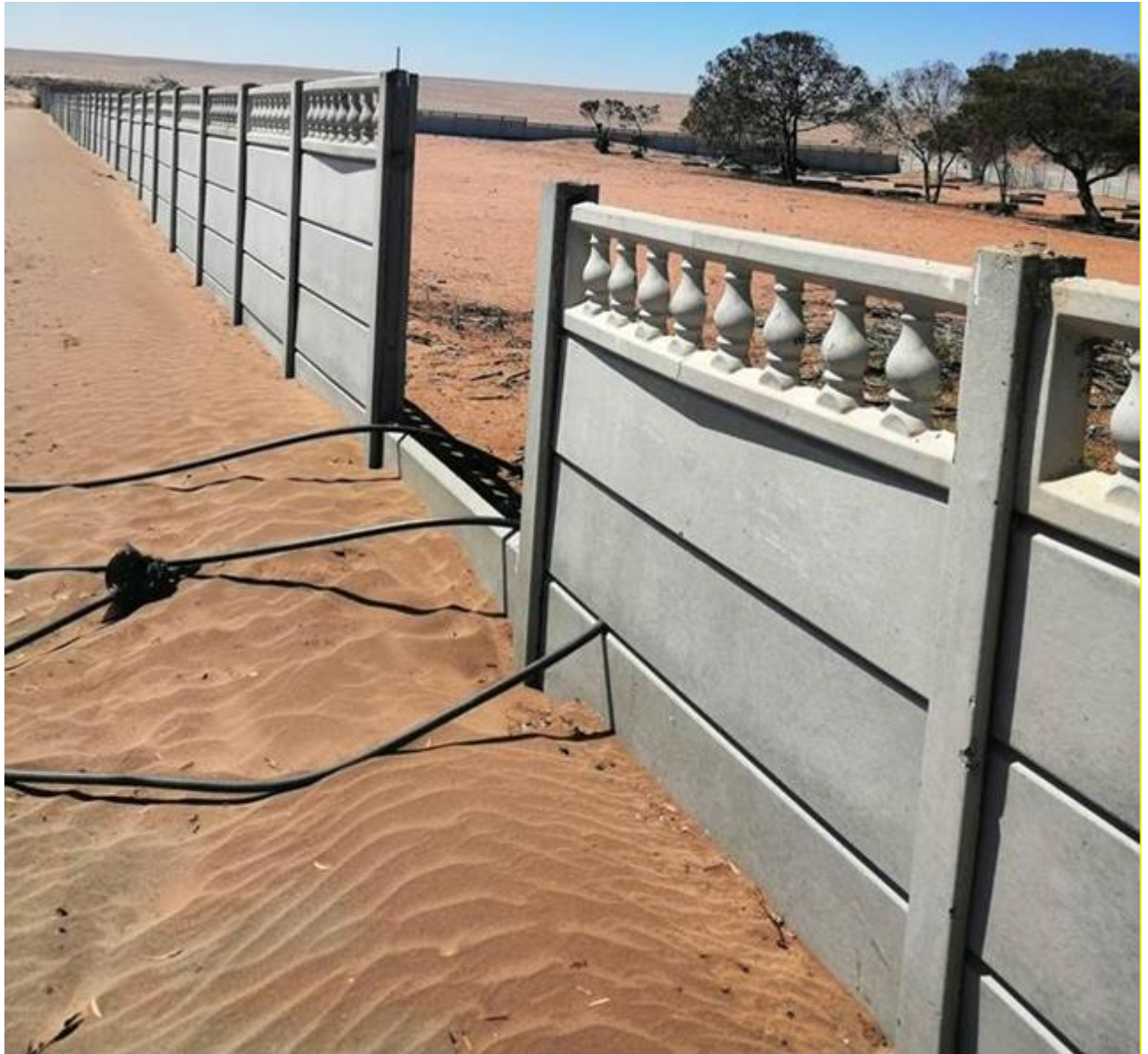
Picture 1 - Boundary Wall to be demolished