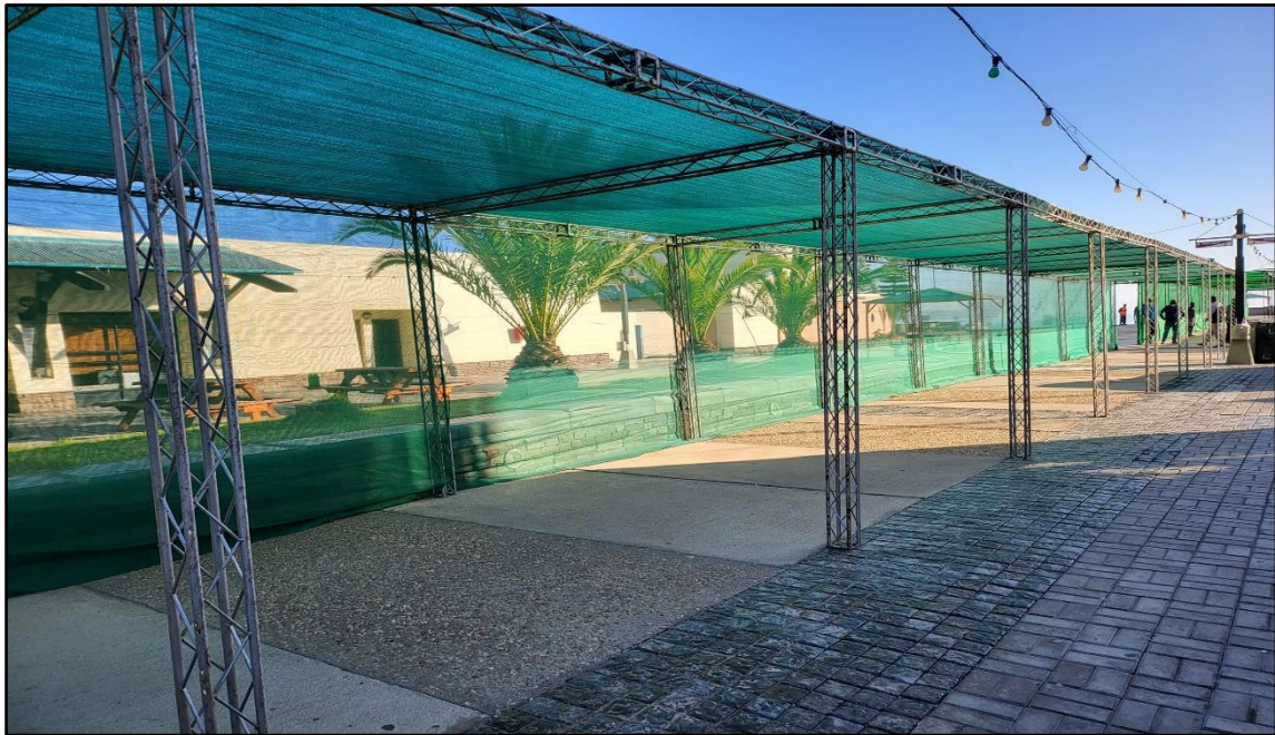
Provision of Partitioning and 60 3mx3m outdoors stalls with shell design